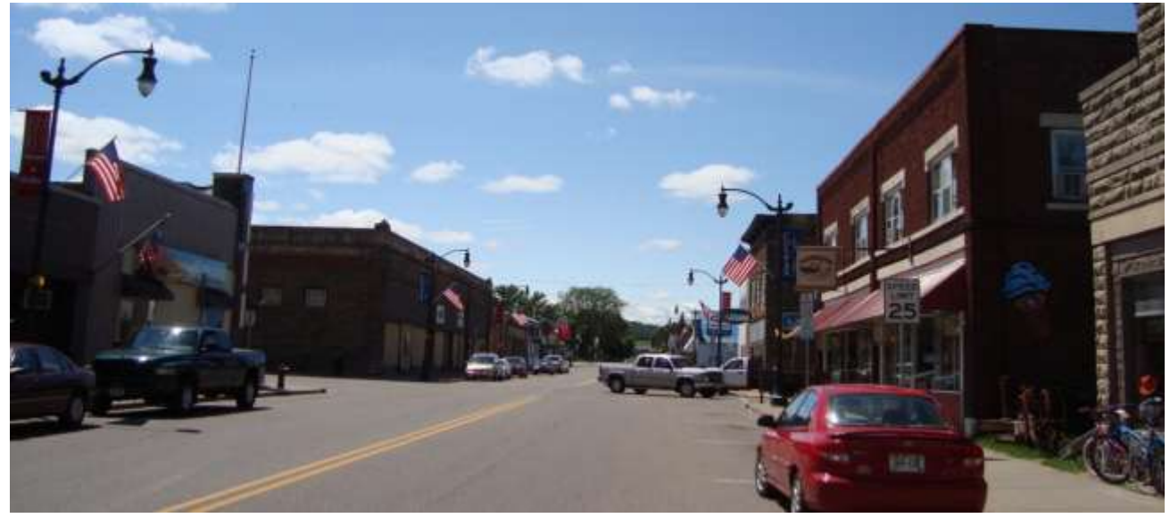
Prepared By West Central Wisconsin Regional Planning Commission