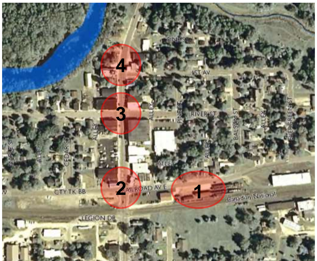
Figure 1: Identified nodes in downtown Colfax